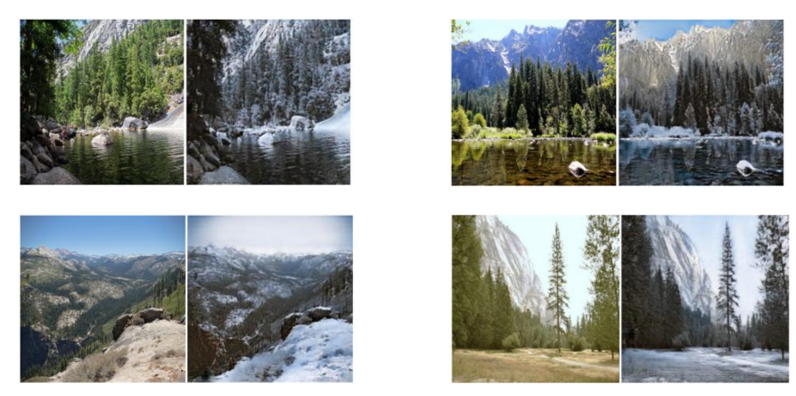
Figure 2. Experimental results

As can be seen from the experimental results, under the condition that the image structure remains unchanged, a summer picture is transformed into a winter picture and the transformed image has no color unbalanced distribution phenomenon, which proves the effectiveness of the algorithm in this paper.